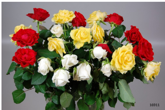
Treatment: water Total vase life: 8 days Photo taken: day 8