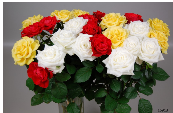
Treatment: Chrysal Clear Fairtrade rose liquid Total vase life: 15 days Photo taken: day 8