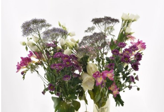
Treatment: water Total vase life: 8 days Photo taken: day 9