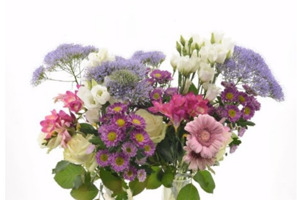
Treatment: Chrysal Universal Bio Based Total vase life: 11 days Photo taken: day 9