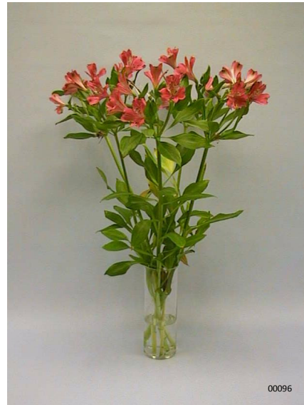
Treatment: Chrysal AVB Total vase life: 19 days Photo taken: day 20