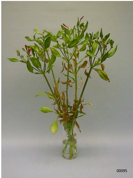
Treatment: water Total vase life: 13 days Photo taken: day 20