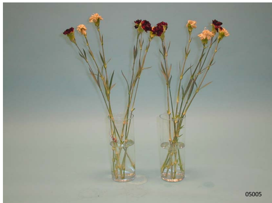
Treatment: water Total vase life: 5 days Photo taken: day 14