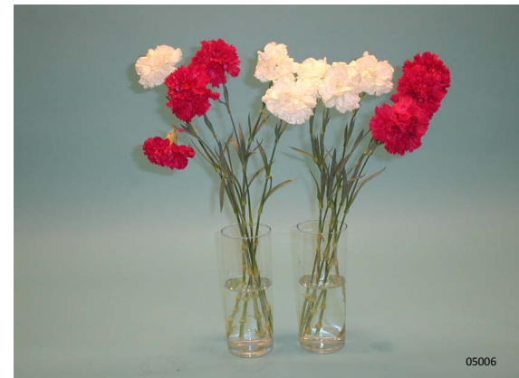
Treatment: Chrysal AVB Total vase life: 16 days Photo taken: day 14