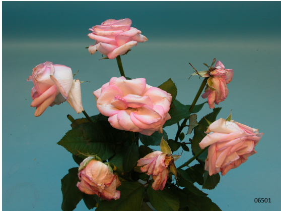
Treatment: water Total vase life: 12 days Photo taken: day 12