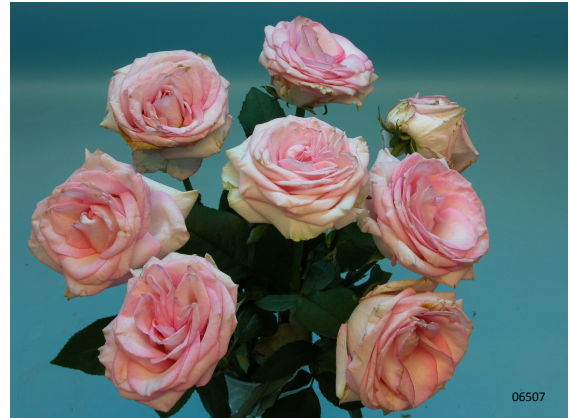
Treatment: Chrysal RVB Clear Intensive Total vase life: 15 days Photo taken: day 12